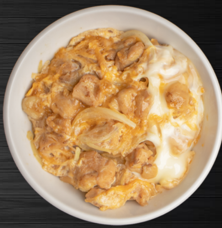
OYAKO DON P190