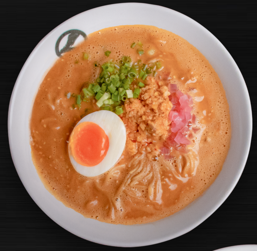
CURRY RAMEN P270 CURRY FLAVORED RAMEN WITH THICK NOODLES