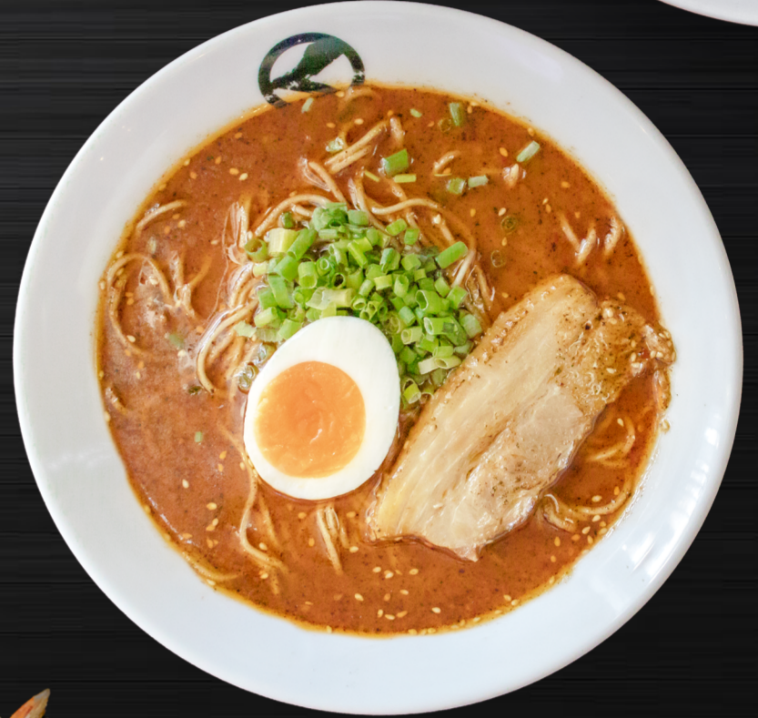
BARI KARA RAMEN P270 A REAL SPICY TASTE RAMEN