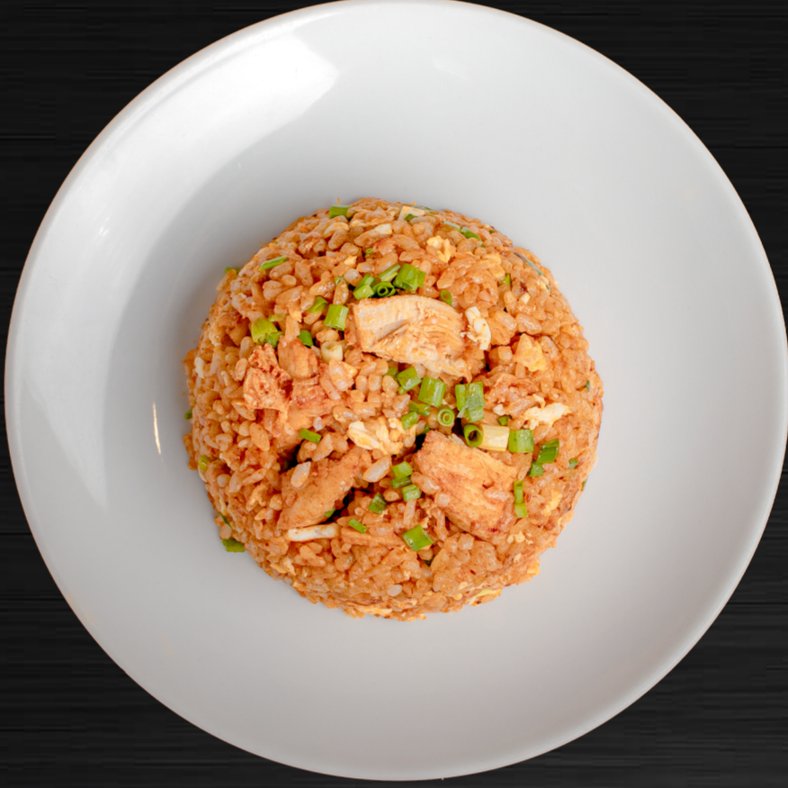
CHAHAN (SHIRO, KURO, AKA) P180