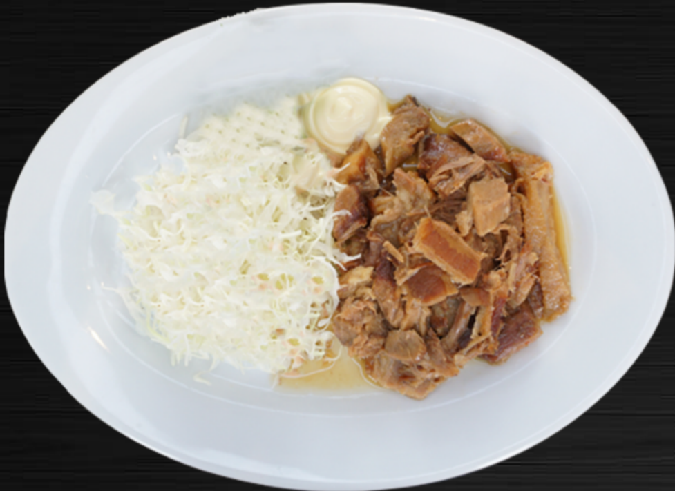
TERIYAKI PORK P160