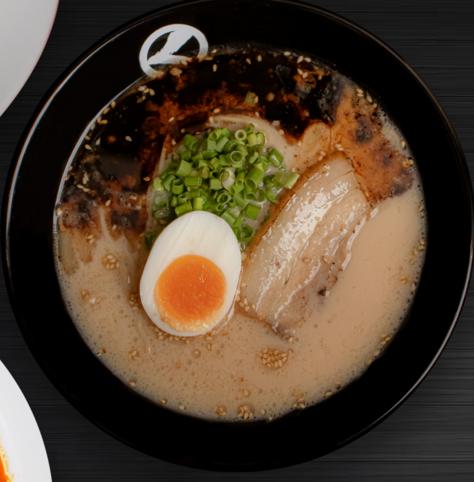
KURO RAMEN P220 TONKOTSU WITH ROAST GARLIC FLAVOR KURO CHASHUMEN P270 ADDITIONAL ROAST PORK