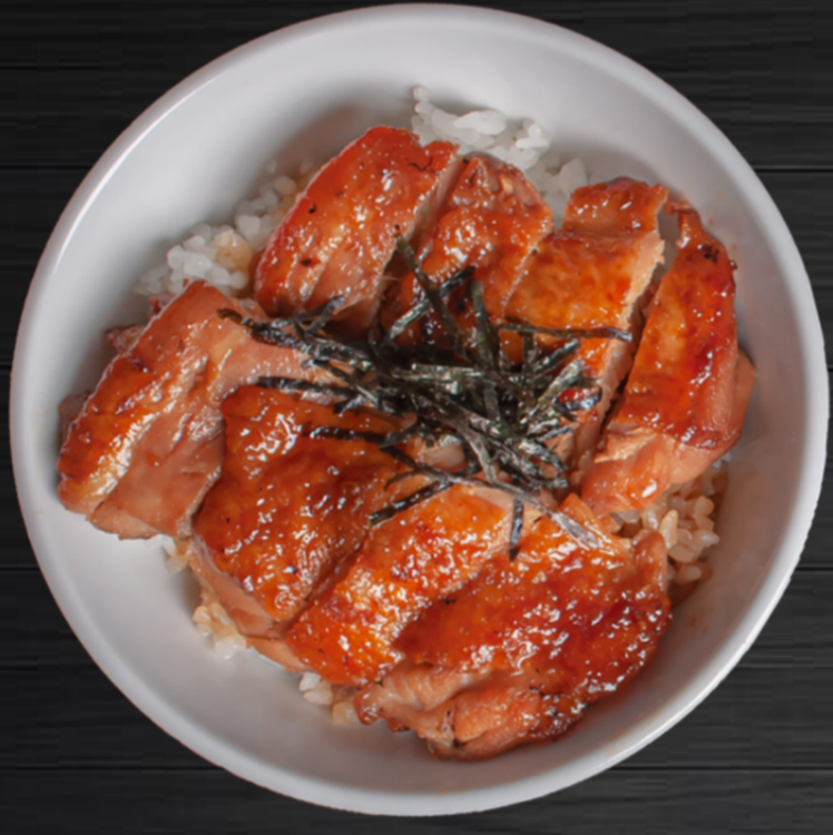
TERIYAKI CHICKEN DON P190