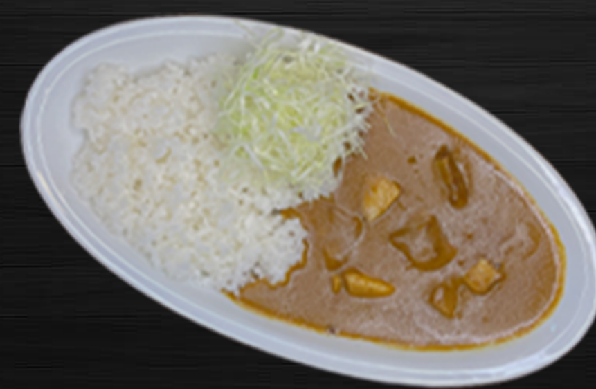
CURRY RICE P200