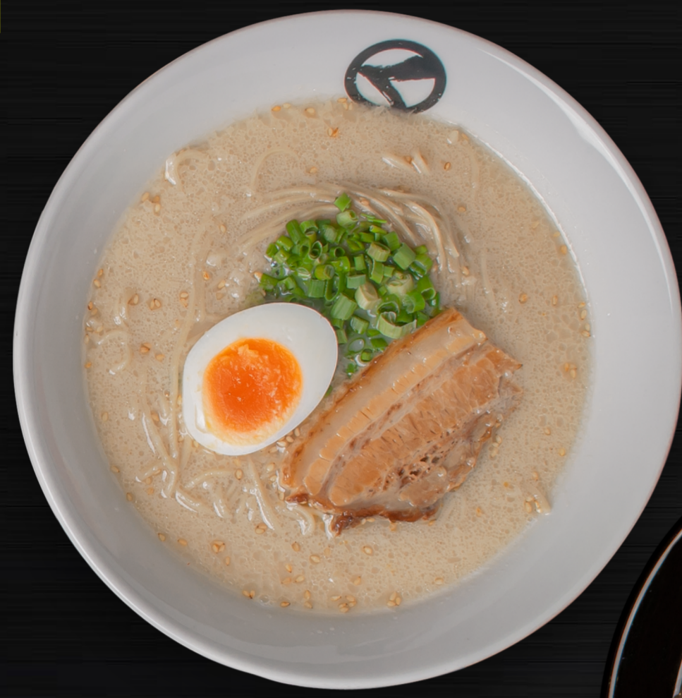
SHIRO RAMEN P220 TONKOTSU WITH BASIC TASTE SHIRO CHASHUMEN P270 ADDITIONAL ROAST PORK