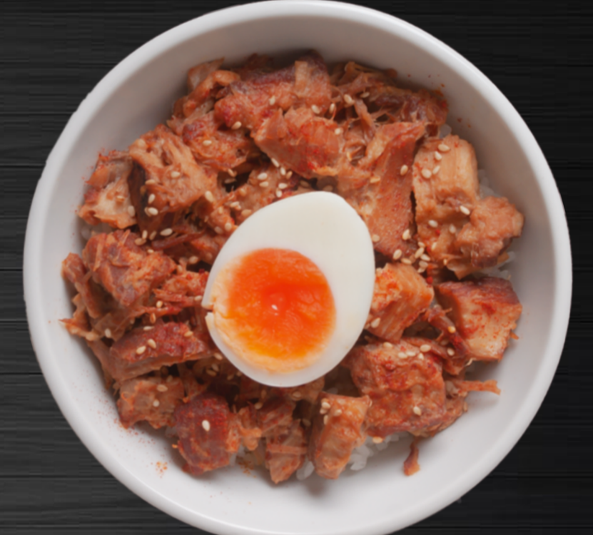
TERIYAKI PORK DON P180