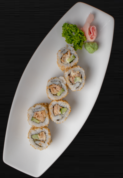
TERIYAKI PORK ROLL P240