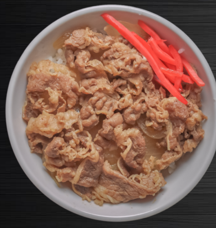
GYU DON P240