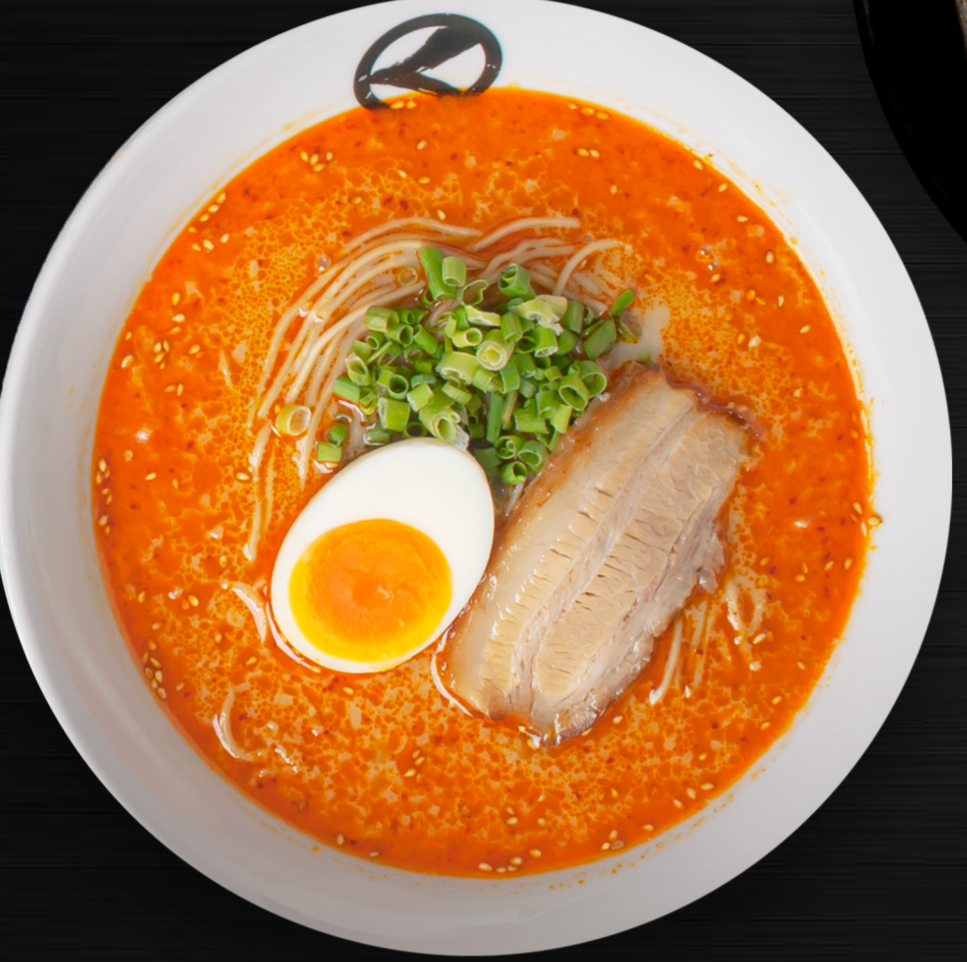
AKA RAMEN P220 TONKOTSU WITH SPICY TASTE AKA CHASHUMEN P270 ADDITIONAL ROAST PORK