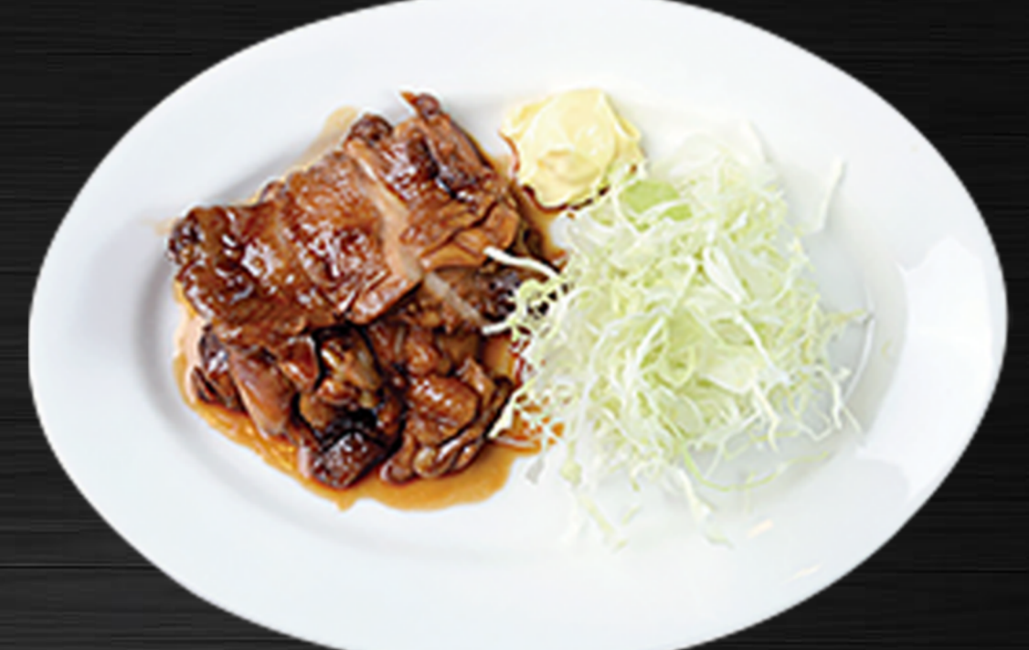
TERIYAKI CHICKEN P200