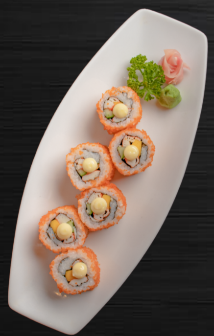
CALIFORNIA ROLL P290