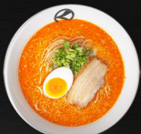
AKA RAMEN P220 TONKOTSU WITH SPICY TASTE