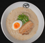
SHIRO RAMEN P220 TONKOTSU WITH BASIC TASTE