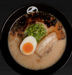
KURO RAMEN P220 TONKOTSU WITH ROAST GARLIC FLAVOR