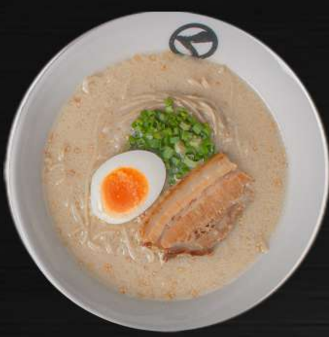
SHIRO RAMEN P200 TONKOTSU WITH BASIC TASTE