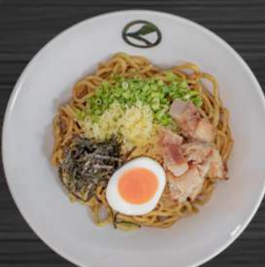
AEMEM P200 NOODLES THAT CAN BE CONSUMED WITHOUT SOUP