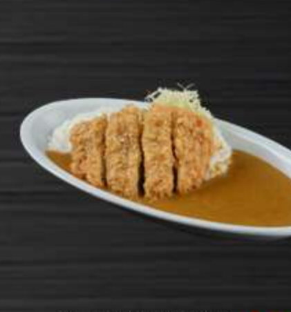
KATSU CURRY P260