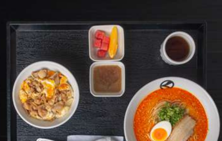
RAMEN OYAKO DON SET P370 RAMEN, OYAKO DON, FRESH FRUITS, 1 CUP OF TEA