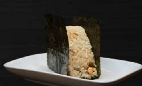
ONIGIRI - SAKE P90