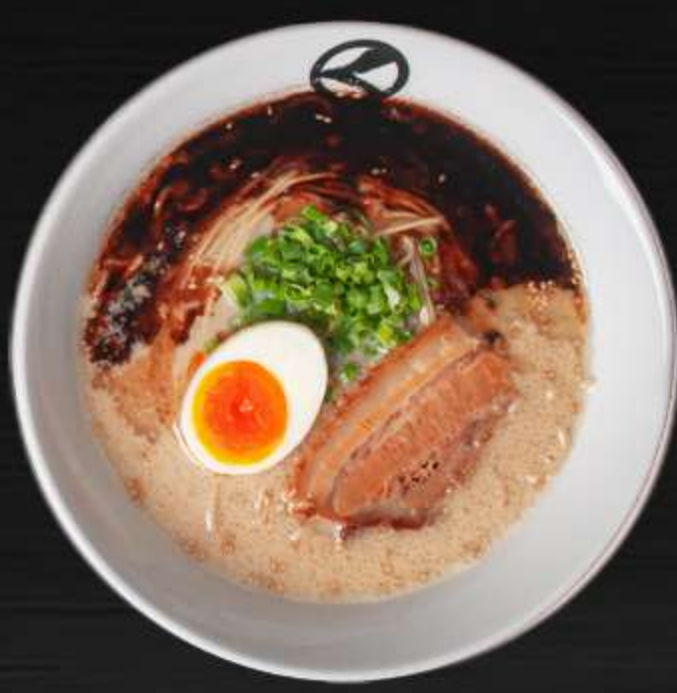
KURO RAMEN P200 TONKOTSU WITH ROAST GARLIC FLAVOR