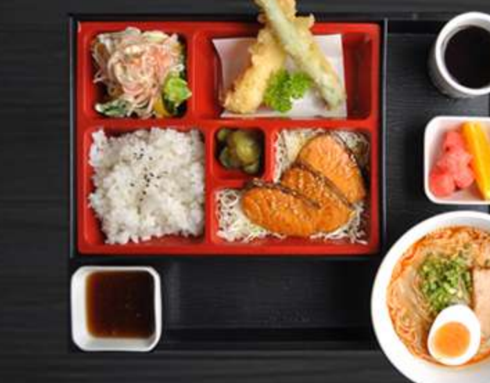
KURODA BENTO HEALTHY SET P520 KANI SALAD, EBI TEMPURA, TERIYAKI SALMON, TSUKEMONO, RICE, FRESH FRUITS AND HALF RAMEN