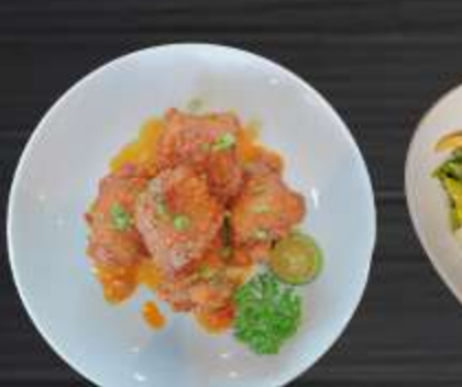
SPICY CHICKEN KARAAGE P260