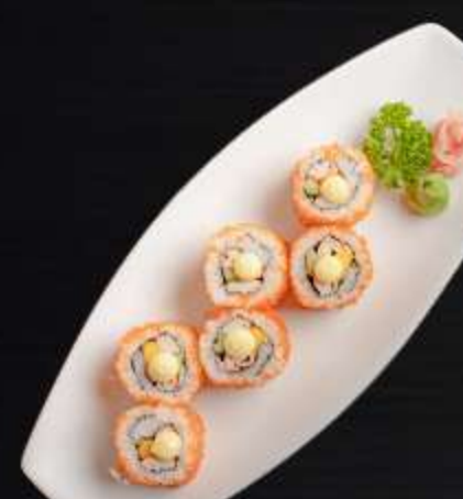
CALIFORNIA ROLL P290