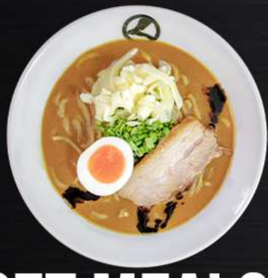
CURRY RAMEN P250 CURRY FLAVORED RAMEN