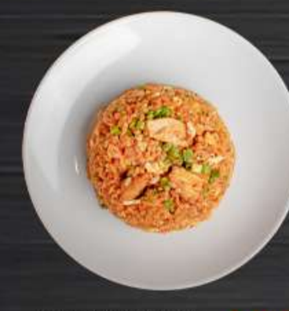
AKA CHAHAN P160