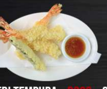
EBI TEMPURA P300