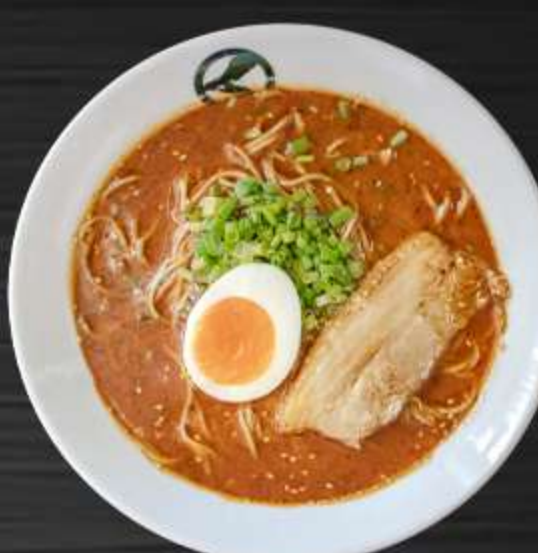
BARİ KARA RAMEN P250 A REAL SPICY TASTE RAMEN