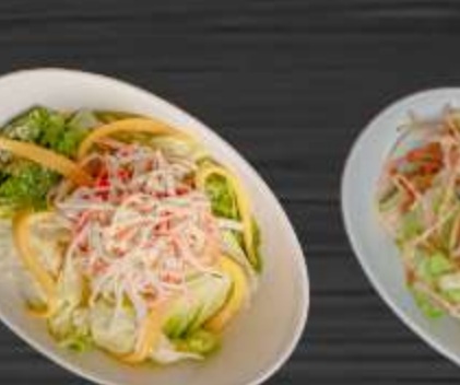
KANI SALAD P240