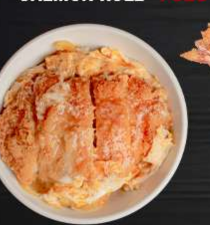
KATSU DON P240