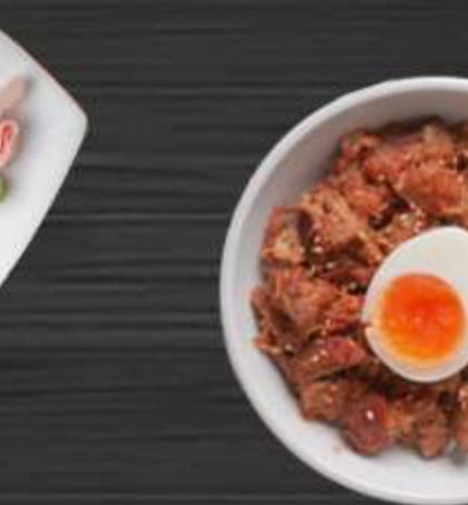
TERIYAKI PORK DON P160