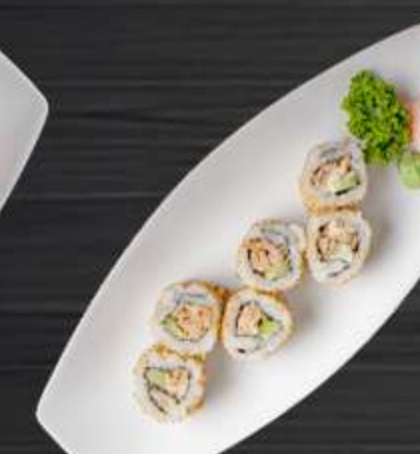
TERIYAKI PORK ROLL P240