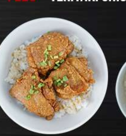
CHICKEN KARAAGE DON P230