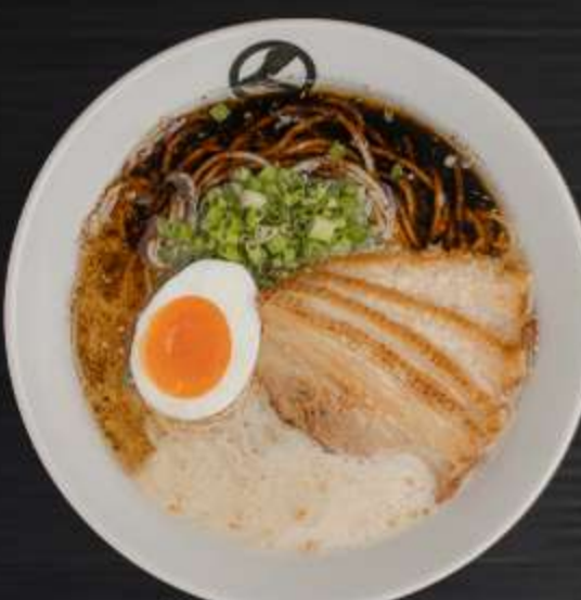
KURO CHASHUMEN P250 ADDITIONAL ROAST PORK