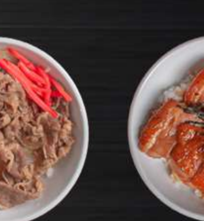
TERIYAKI CHICKEN DON P190