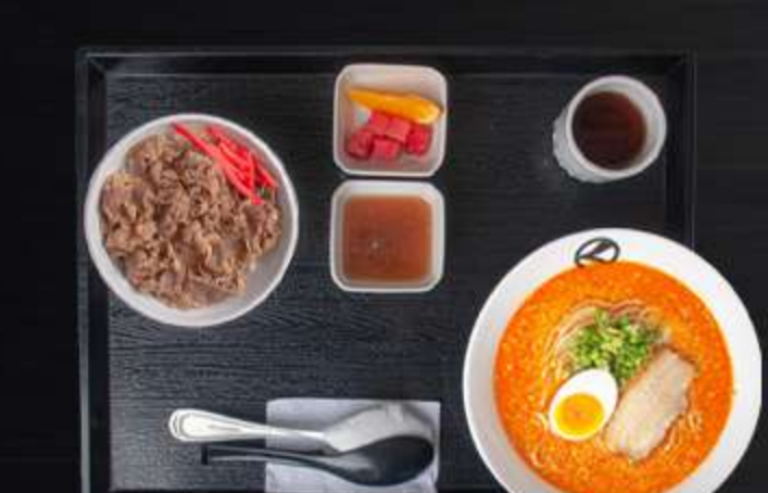
RAMEN GYU DON SET P390 RAMEN, GYU DON, FRESH FRUITS

RAMEN CHAHAN SET P360 PLEASE CHOOSE YOUR FAVORITE RAMEN AND CHAHAN ONE BY ONE SERVED WITH FRESH FRUITS