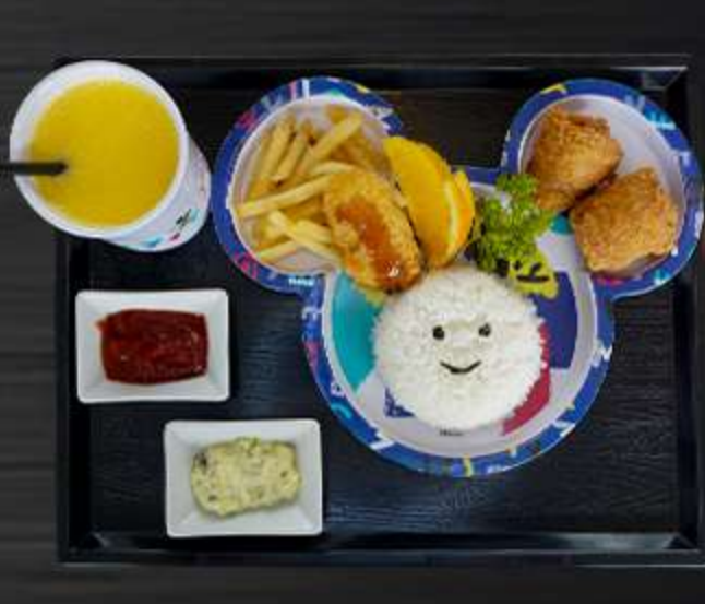
KURODA KIDS MEAL P230 CHICKEN KARAAGE, POTATO CROQUETTE, FRENCH FRIES, RICE, ORANGE, MANGO JUICE