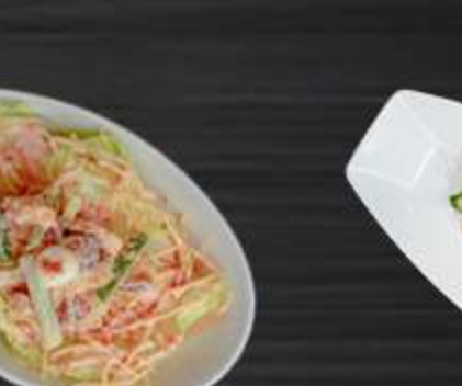
PORK SALAD P200