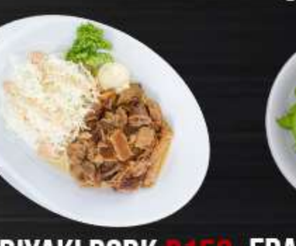
TERIYAKI PORK P150