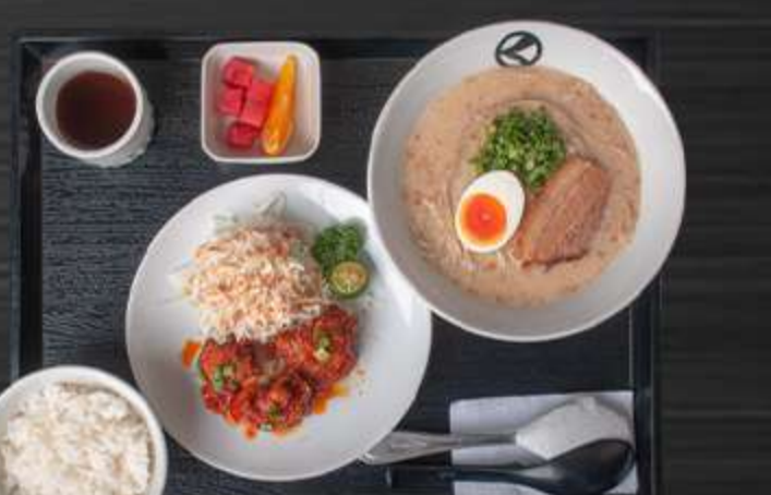
RAMEN SPICY CHICKEN KARAAGE SET P380 RAMEN, SPICY CHICKEN KARAAGE, FRESH FRUITS (CHOICE OF RICE OR ONE EXTRA NOODLES)