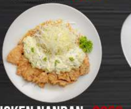
CHICKEN NANBAN P260