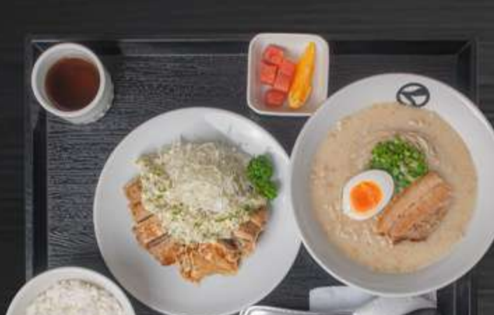
RAMEN CHICKEN NANBAN SET P380 RAMEN, CHICKEN NANBAN, FRESH FRUITS (CHOICE OF RICE OR ONE EXTRA NOODLES)