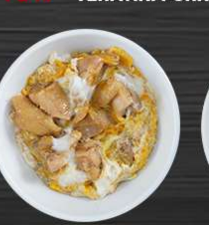
OYAKO DON P190