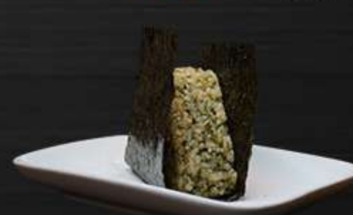
ONIGIRI - TANUKI P90