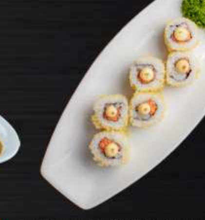
SALMON SPICY ROLL P300