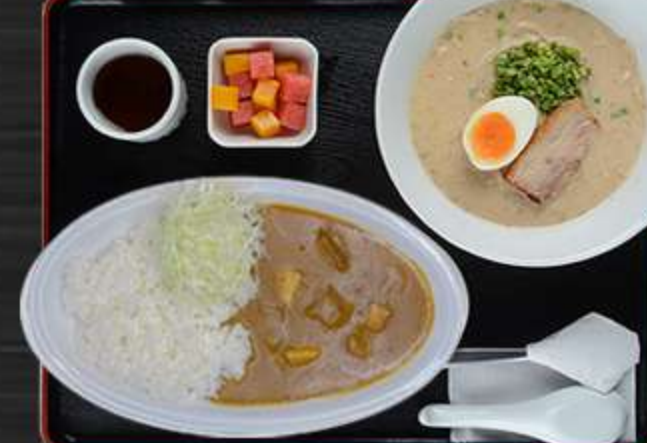
RAMEN CURRY RICE SET P380 RAMEN, CURRY RICE, FRESH FRUITS

RAMEN CHAHAN SET P360 PLEASE CHOOSE YOUR FAVORITE RAMEN AND CHAHAN ONE BY ONE SERVED WITH FRESH FRUITS