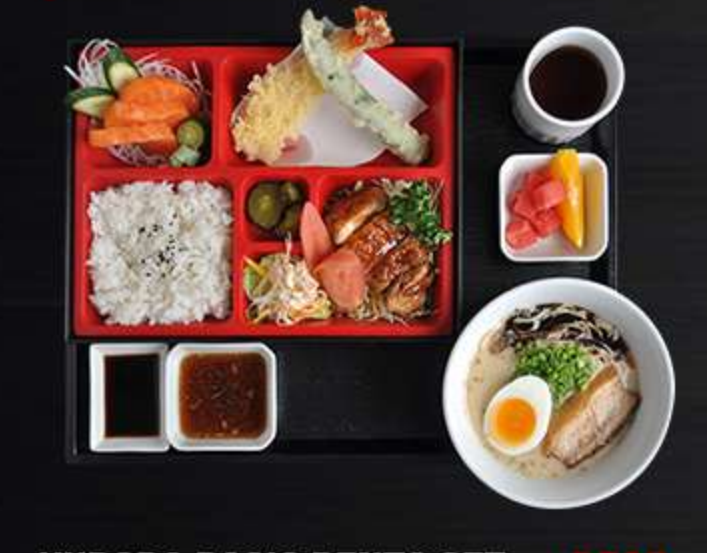
KURODA BASIC BENTO SET P520 SALMON SASHIMI, EBI TEMPURA, CHICKEN TERIYAKI, TSUKEMONO, RICE, FRESH FRUITS AND HALF RAMEN