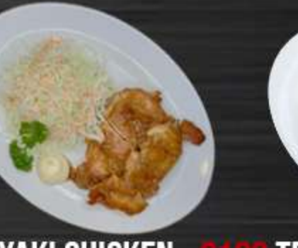
TERIYAKI CHICKEN P180