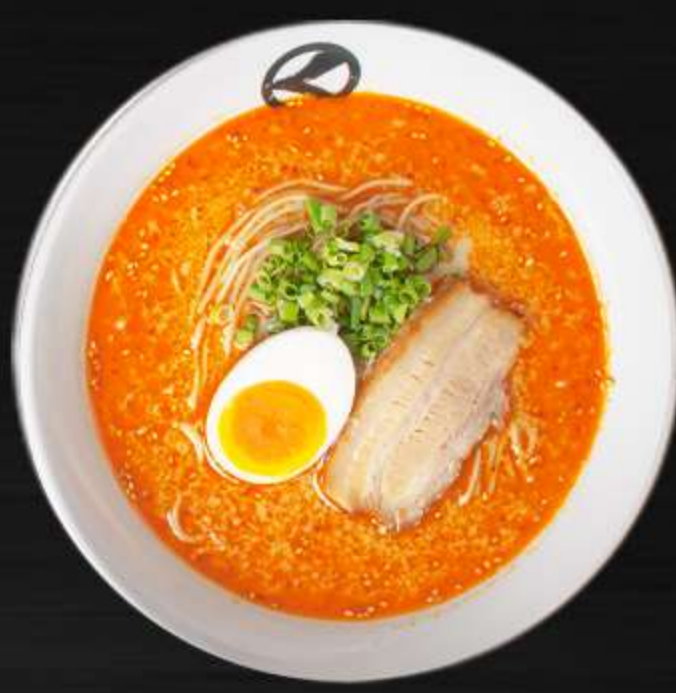
AKA RAMEN P200 TONKOTSU WITH SPICY TASTE