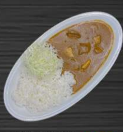
CURRY RICE P180