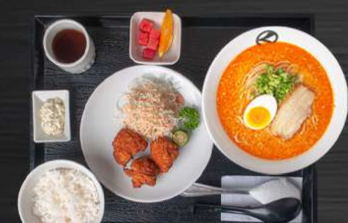
RAMEN CHICKEN KARAAGE SET P380 RAMEN, CHICKEN KARAAGE, FRESH FRUITS (CHOICE OF RICE OR ONE EXTRA NOODLES)