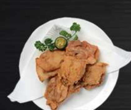
CHICKEN KARAAGE P260