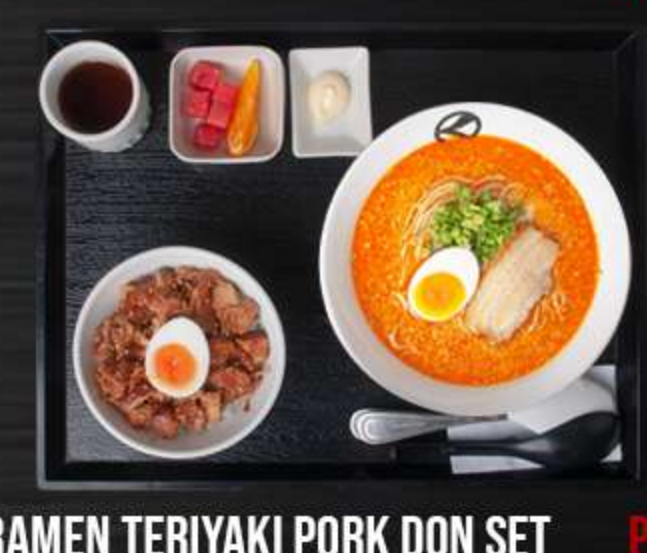
RAMEN TERIYAKI PORK DON SET P340 RAMEN, TERIYAKI PORK DON, FRESH FRUITS