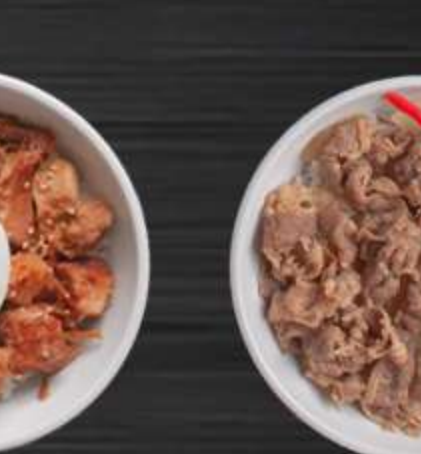
GYU DON P220