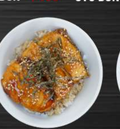
TERIYAKI SALMON DON P230