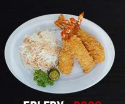
EBI FRY P300