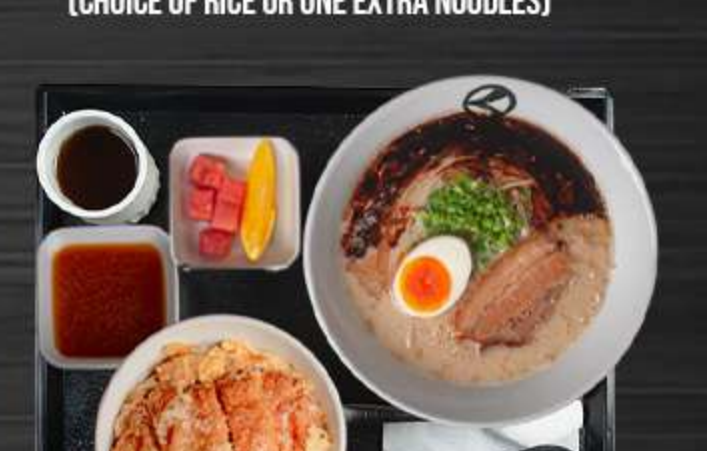
RAMEN KATSU DON SET P420 RAMEN, KATSU DON, FRESH FRUITS