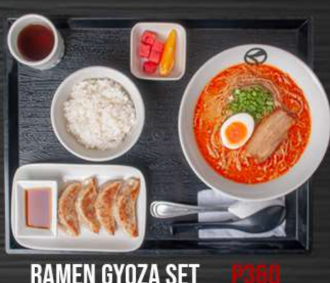
RAMEN GYOZA SET P380 RAMEN, GYOZA, RICE, FRESH FRUITS (CHOICE OF RICE OR ONE EXTRA NOODLES)