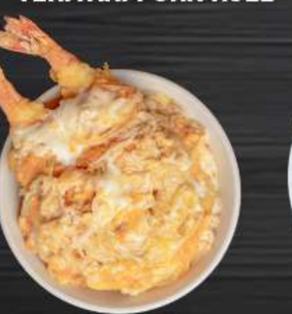
TENTOJI DON P320