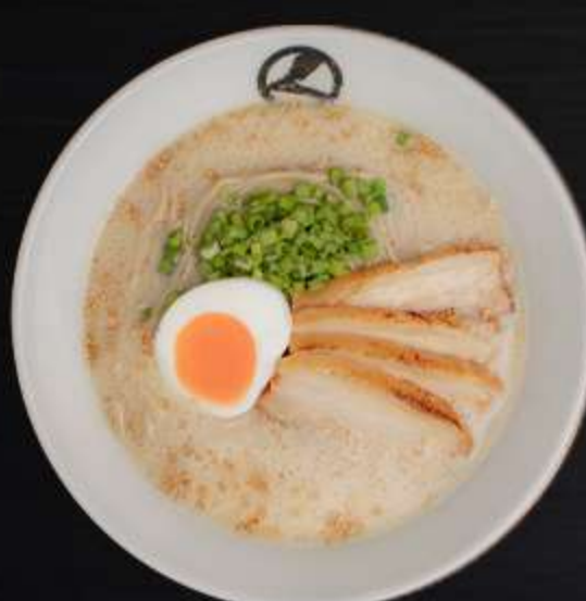
SHIRO CHASHUMEN P250 ADDITIONAL ROAST PORK