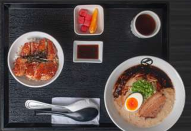
RAMEN TERIYAKI CHICKEN DON SET P380 RAMEN, TERIYAKI CHICKEN DON, FRESH FRUITS