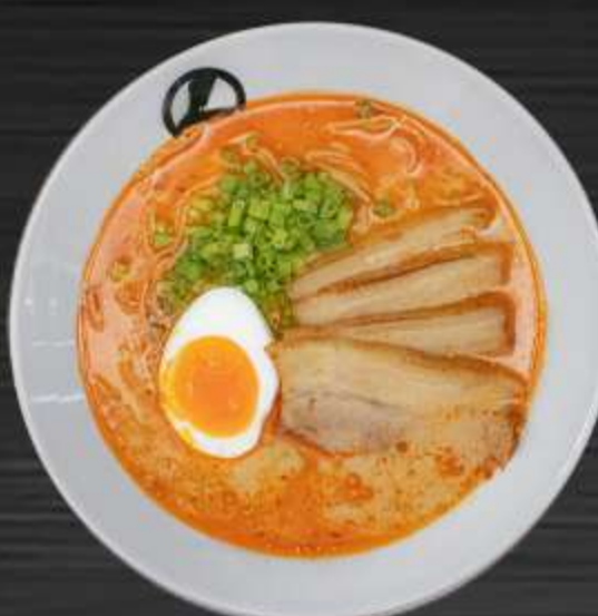
AKA CHASHUMEN P250 ADDITIONAL ROAST PORK