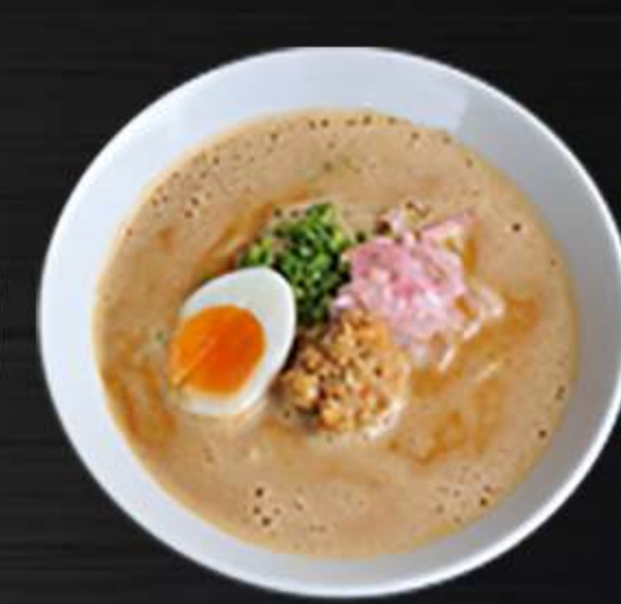
TAN TAN MEN P250 SESAME PASTE WITH SWEET, SPICY AND SOUR FLAVOR