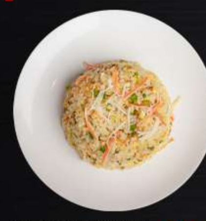
SHIRO CHAHAN P160