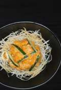
SALMON SPICY SALAD P260