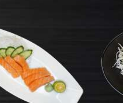
SALMON SASHIMI P320