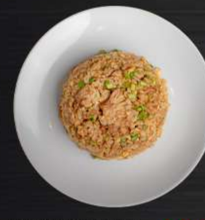
KURO CHAHAN P160