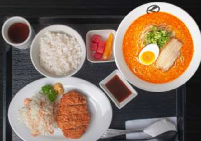
RAMEN TONKATSU SET P400 RAMEN, TONKATSU, FRESH FRUITS (CHOICE OF RICE OR ONE EXTRA NOODLES)