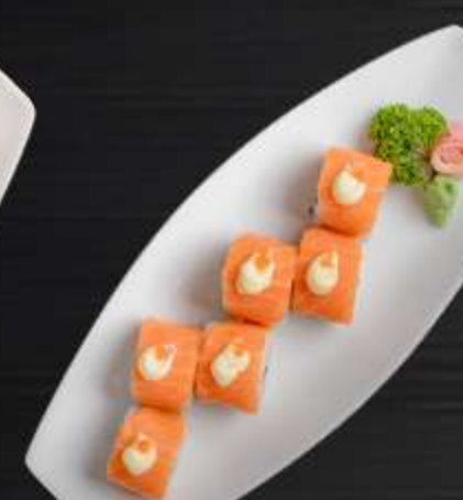
SALMON ROLL P320